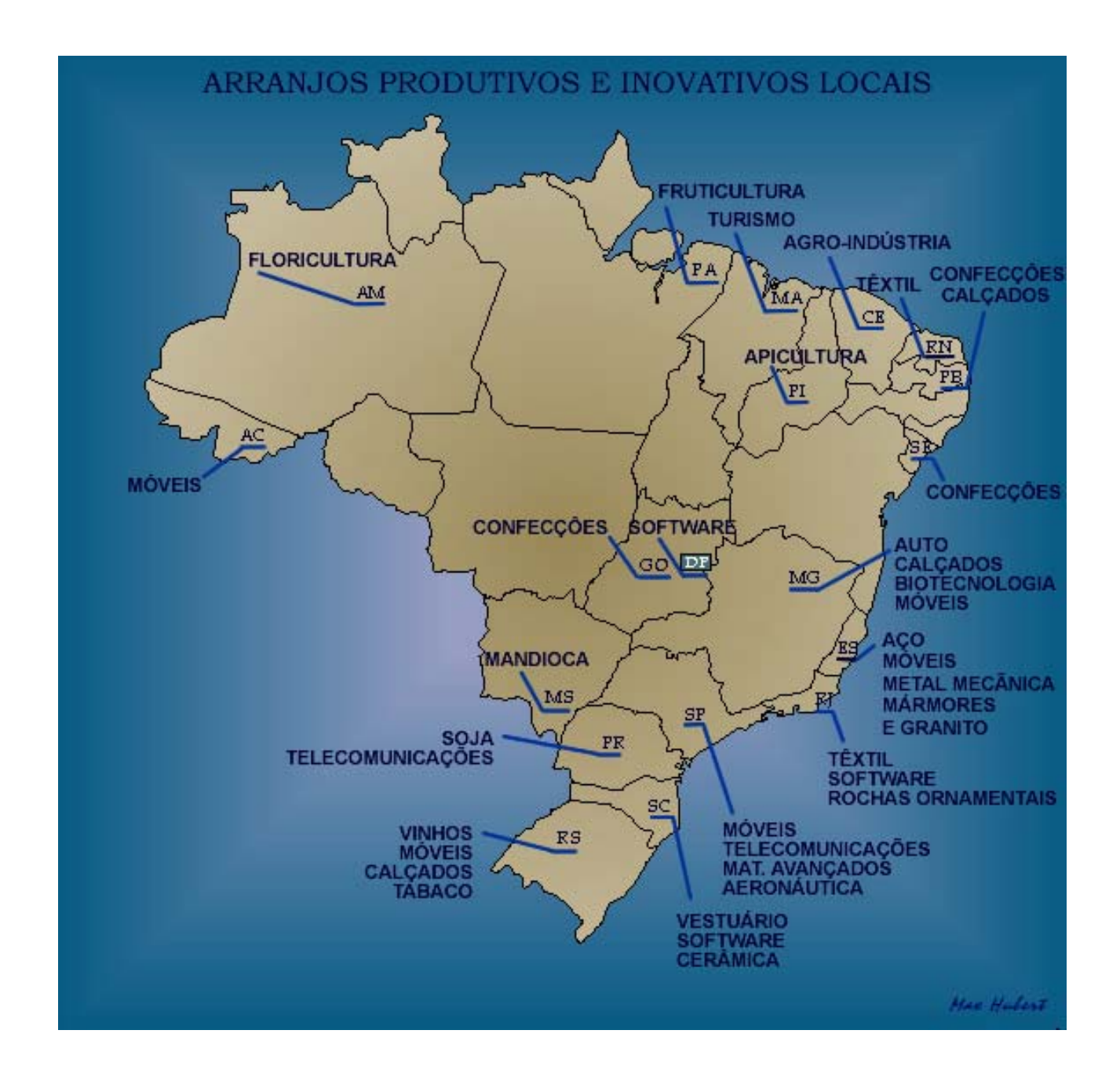
Map 1 Local productive and innovative arrangements analyzed by RedeSist in Brazil